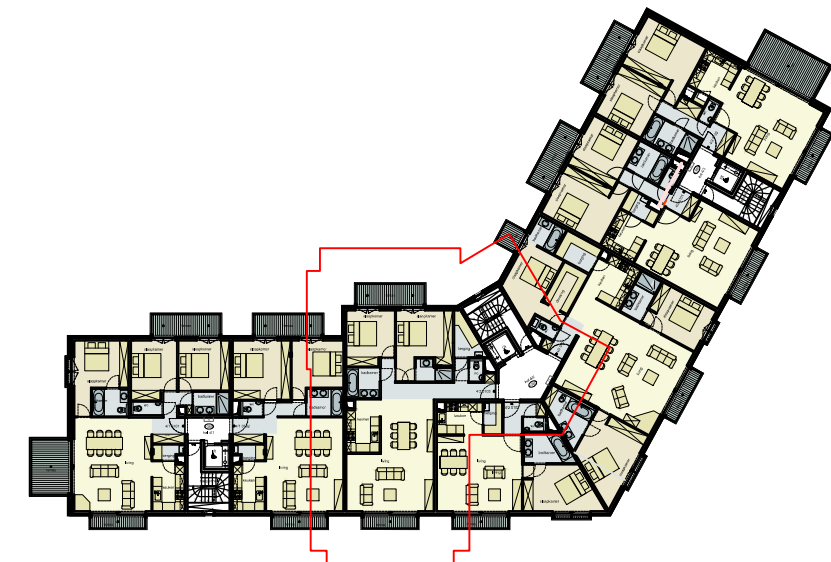
Positie in bouwblok, schaal 1/500